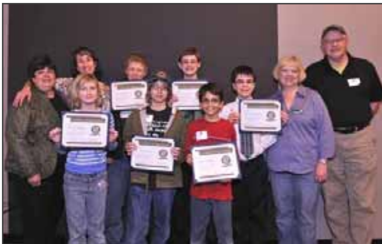
OYBC's Columbus Chapter members recognized for their conservation work at the Columbus Audubon Annual Meeting.

The Ohio Young Birders Club has maintained an active schedule of events throughout the winter, continuing into the spring and summer. Highlights included participating in Christmas Bird Counts in December and January, teaming up with BSBO at the Killdeer Plains Wildlife Area Winter Blues Blowout in February, and attending the Shreve Migration Sensation Festival in March.